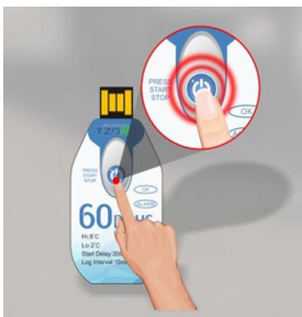
Press the button to start