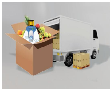
Put into the box / carton